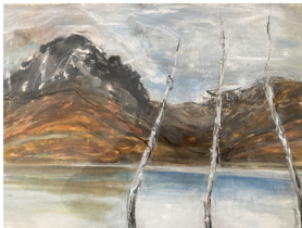
FISHING NET POSTS...LONG AGO