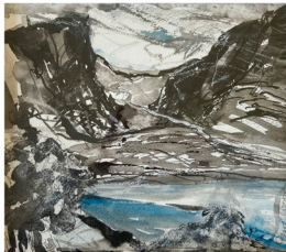
WINTER TIME ON THE BEALACH SOLD