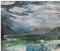
DECEPTION BAY 2