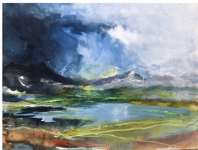
DECEPTION BAY I